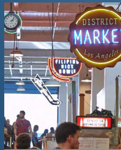
Grand Central Market